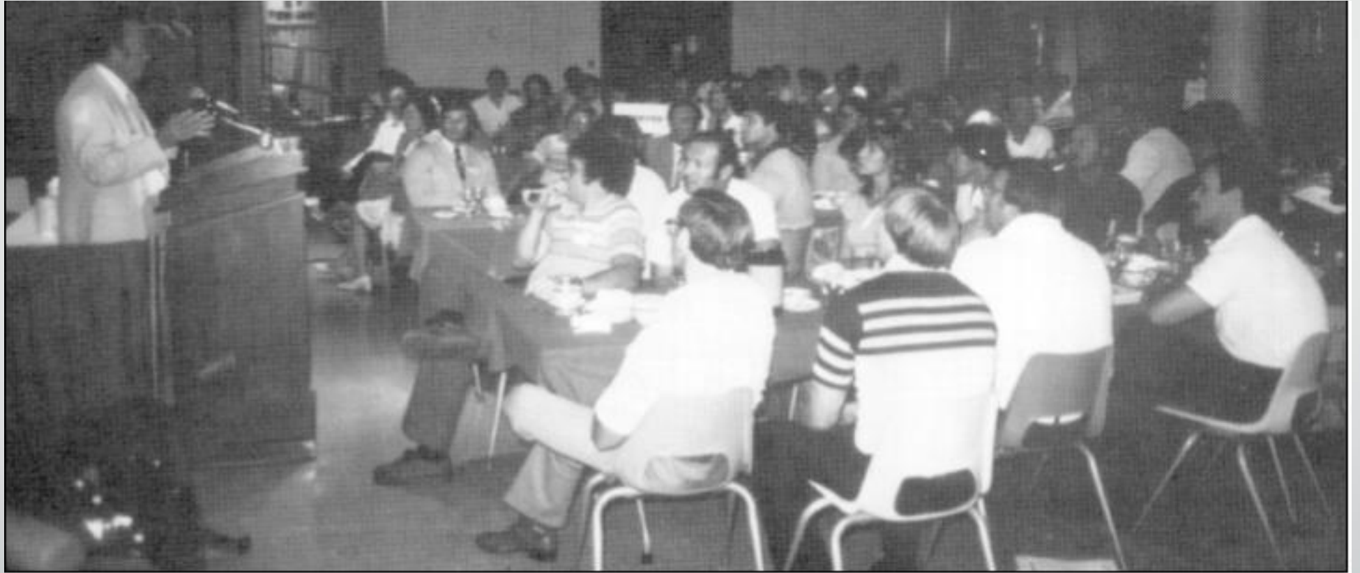
Bob Devaney Nebraska Athletic Director was the first NSCA Keynote Speaker